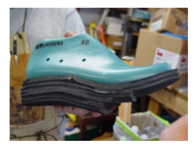
4. The buildup is complete in the rough form, ready for sanding and finishing.

2. Cement the pieces together to buildup the layers to the desired height to match the pattern.