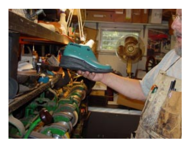
6. When finished, the top side of the wedge will be form fitting to the bottom of the last, and the bottom side of the wedge will be flat.