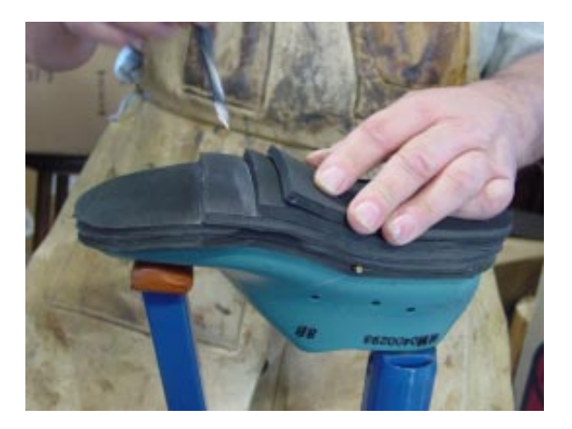
3. NOTE: Cut the pieces larger than the pattern. They will be sanded down to the final shape later.

1. Cut several pieces of the material that will be used for the wedge buildup. Attach one piece full length to the bottom of the last.