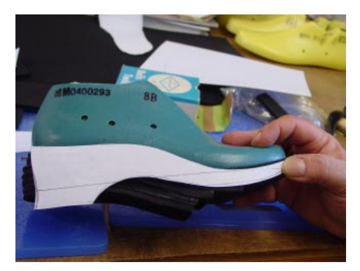
Pattern for Sculpted Wedge Platform.